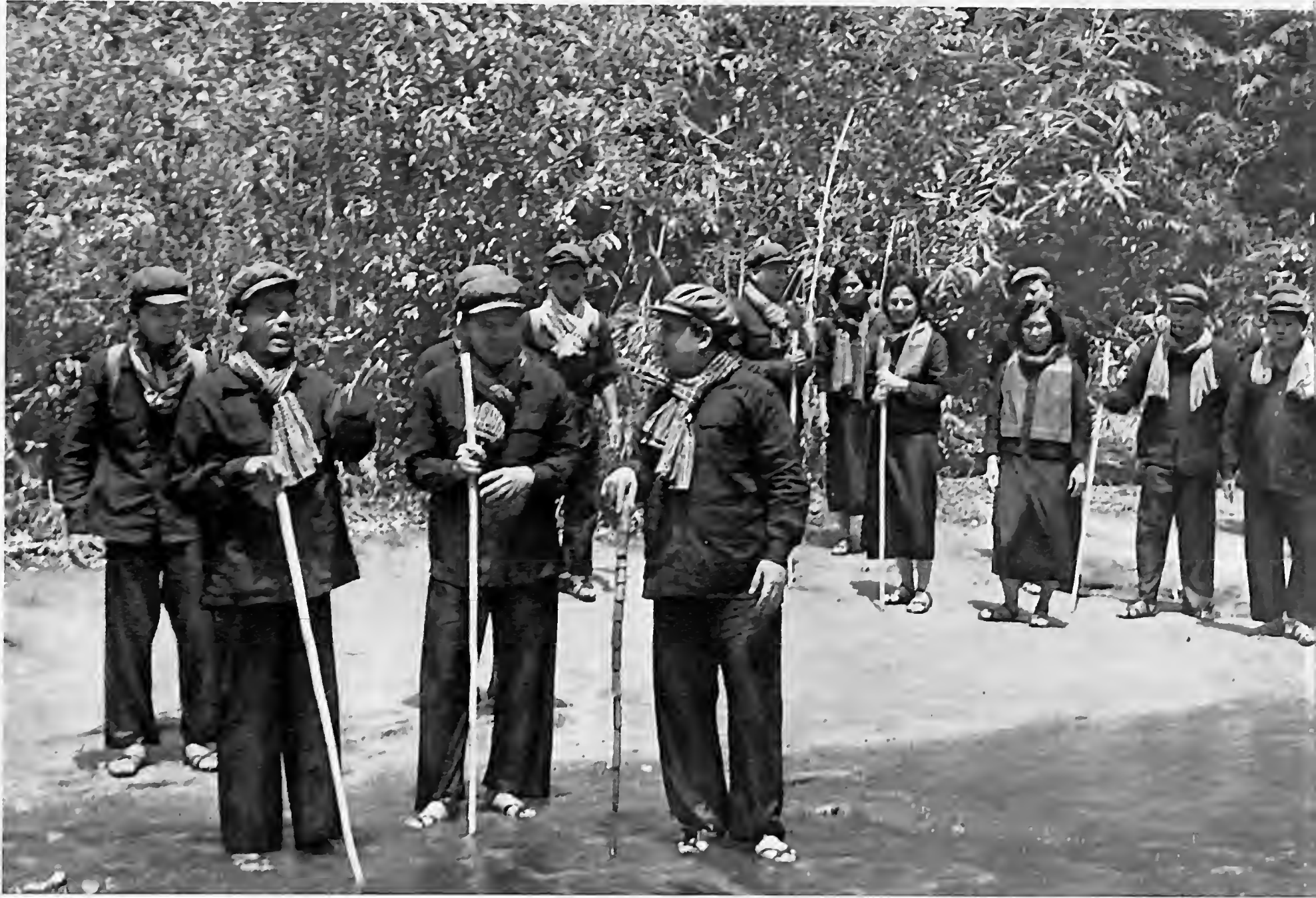
Samdech Sihanouk ready for a new tour on foot. Son Sen (left, front), Chief of the General Staff of the P.A.F.N.L.C., describing the route.